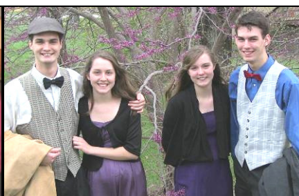
Our jr. & sr. high school kids dressed for a fun afternoon out