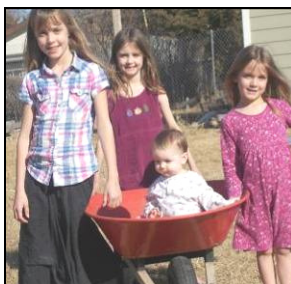
Our little girls at play

I am saddened that so many international students never get to see the inside of an American home, and I pray that the students who visit us are blessed by catching a glimpse of an American home life that is dedicated to the Lord Jesus. We pray that the work of the Holy Spirit is displayed in our interpersonal relationships, that the glory of our Heavenly Father is displayed through the arts and skills expressed in our home, and that the redemption of our Lord Jesus is displayed through the traditions and culture and conversations in our home.